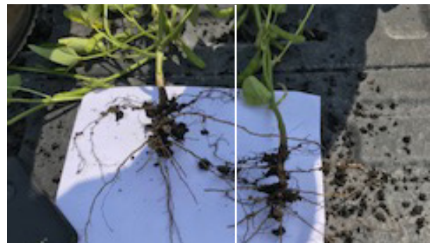
Treated 54.1 bu/ac